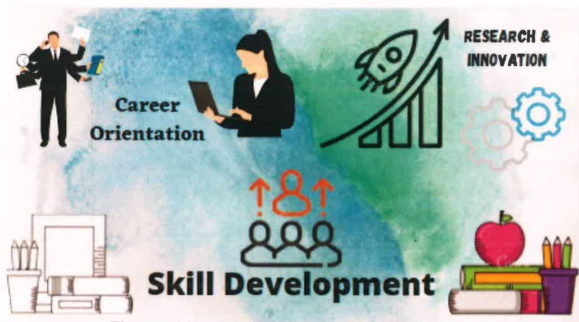
Figure: Vision 2025 for Student's Overall Development

“Talented and research-oriented individuals”